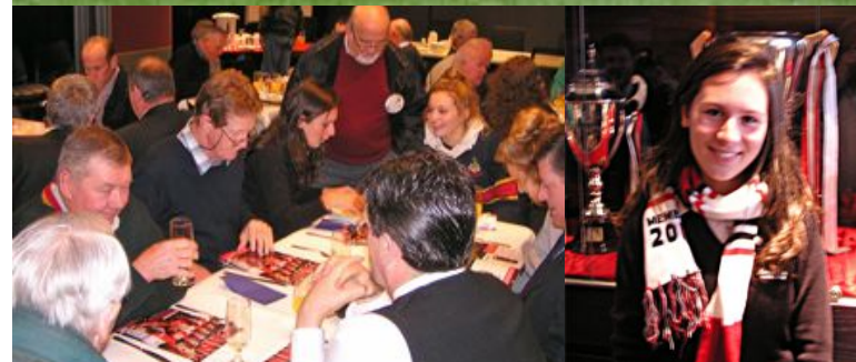
SAINT MARIE OF BELVEDERE